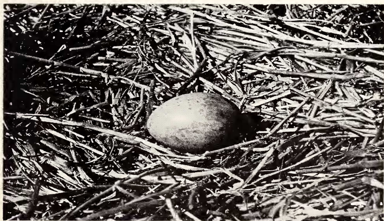
Fig. 2. Nest site and egg of Sandhill Crane, 9 June 1960 (Photographs Fig. 2 through Fig. 7 by E. G. F. Sauer).

Falco rusticolus. Two Gyrfalcons were noted soaring above Sivokak Mountain on 22 and 24 August.